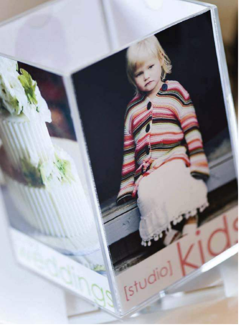
A simple table display might be an attractive addition to your studio's decor.

print, ready for delivery, what would you say? You can't simply say, "Well, the lab charges me $2 for an 8x10, so if I sell it for $10 I'm making $8 in profit!" It doesn't quite work that way. Let's think about this question for a minute. In addition to the lab bill, there was the time that you spent talking with the client on the phone, conducting their consultation, and shooting the actual session. There was the digital media that the image was stored on (or, if you are a film shooter, the cost of the film, processing and proofing). There was also the labor and time required to manage that image from capture, to download, to editing, to backup, to selling. And let's not forget the commissions paid to get the order, the cost of retouching and image manipulation, shipping expenses for getting that file to and from the lab, and the costs for mounting and laminating, and stamping the print. There were also costs for boxing, bagging, or framing the image,